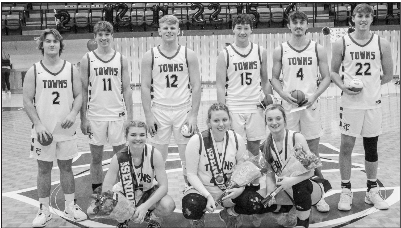
Towns County High School honored its basketball seniors during Saturday's win over Aquinas.